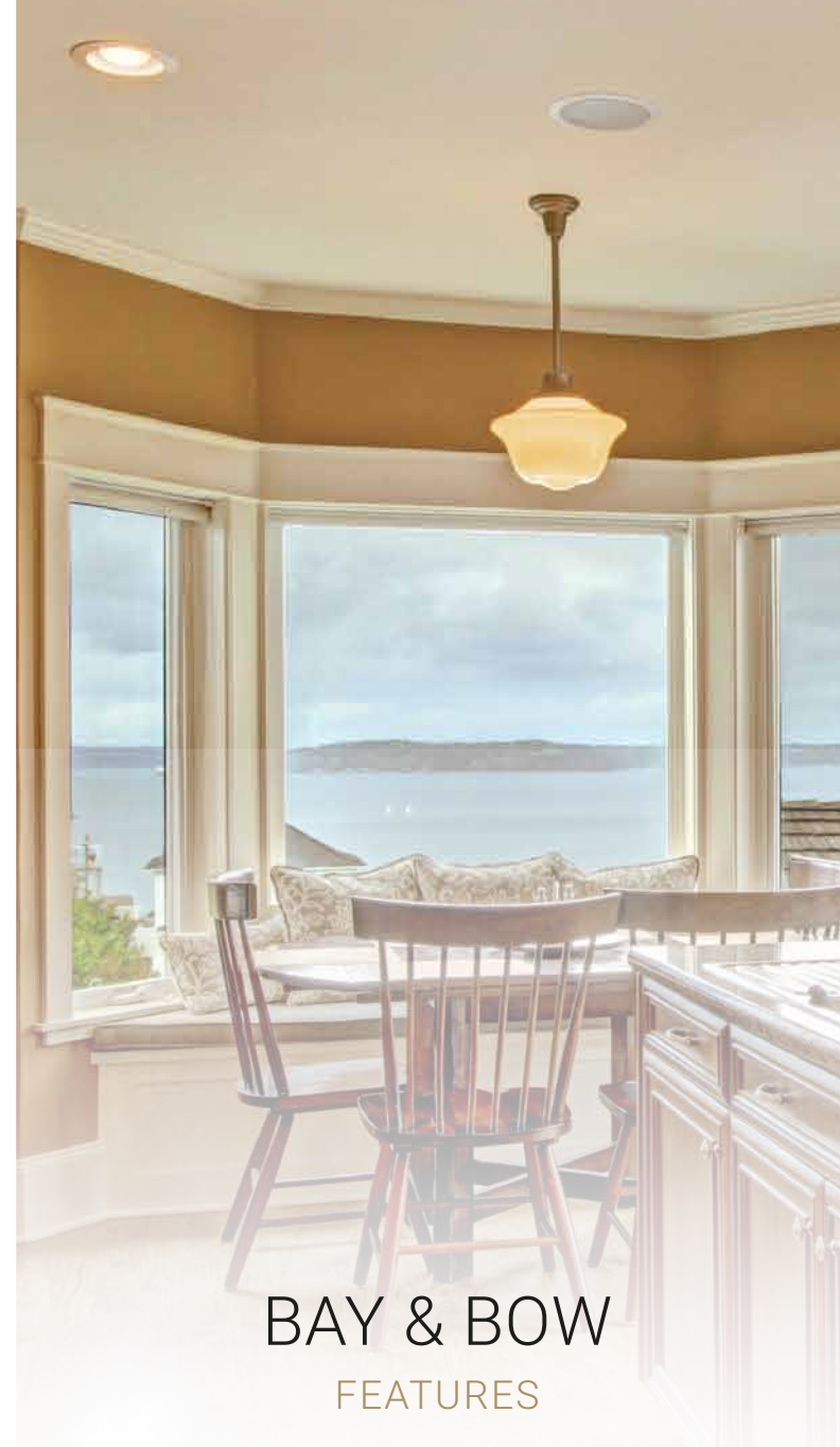
BAY & BOW FEATURES